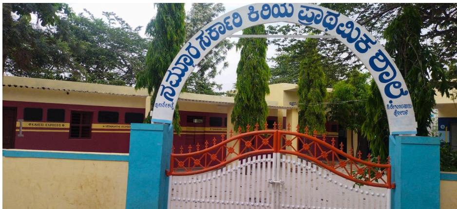
Action 1: Hunasekatte GLPS school painting, Hireguntanuru GP.