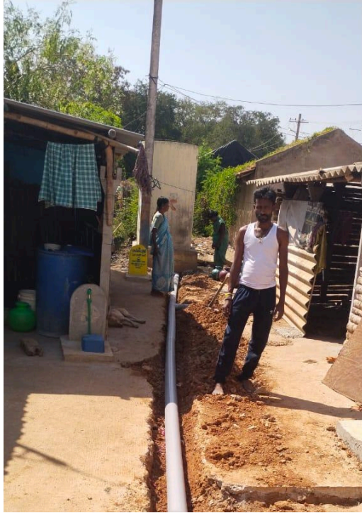
Action 11: Pipelines supplying drinking Gollarahatti, water to Chikkaguntanuru and Hireguntanuru Gollarahatti repaired.