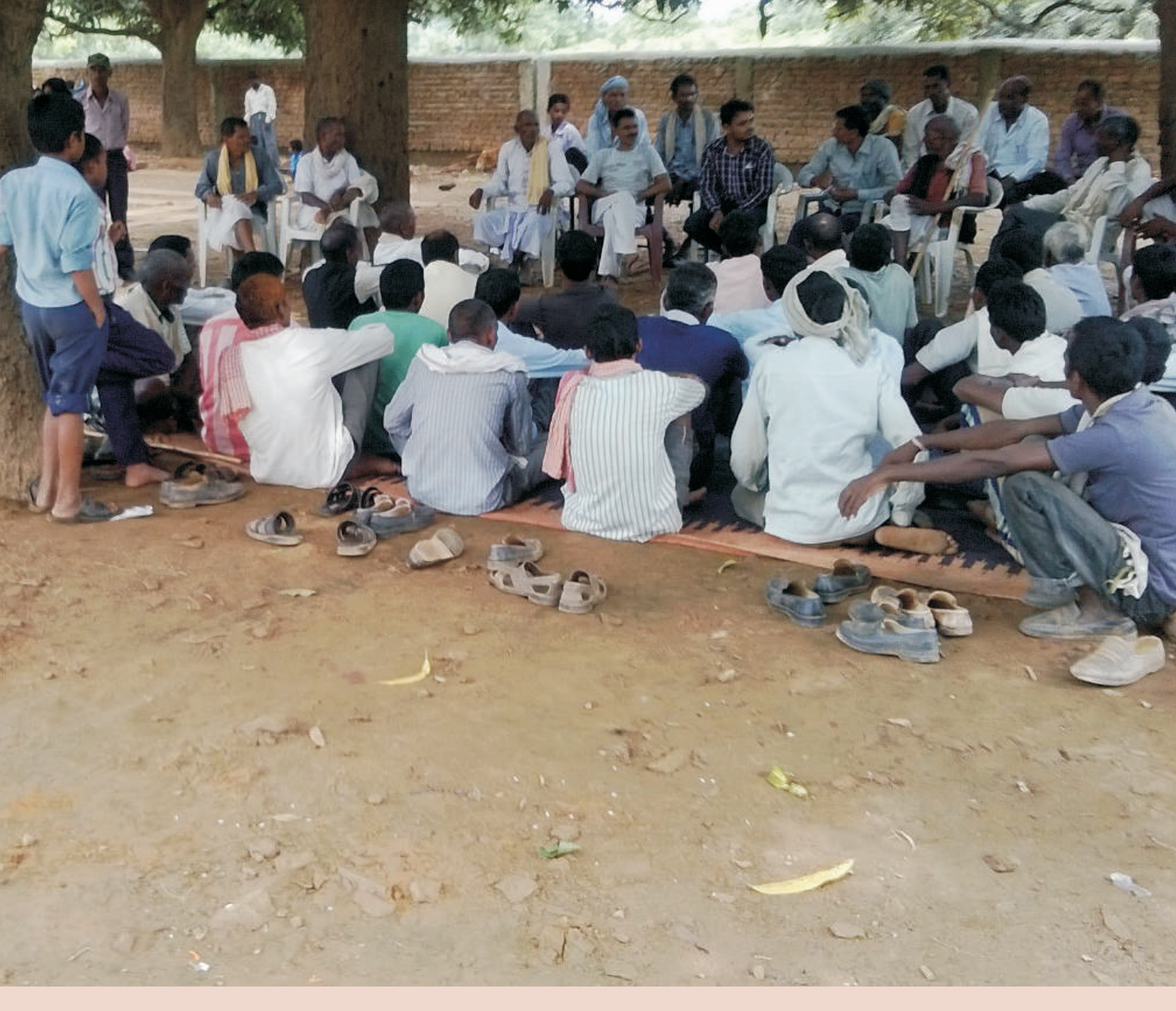
A gram sabha meeting in village Pondi in district Sidhi, Madhya Pradesh

As far as democratic decentralization is concerned, the most significant platform for exercise of voice is the gram sabha . In almost every state, a citizen, who participates in the gram sabha , is poor and vulnerable. The challenge for democratic decentralization is to convert the passive participation of the poor in the gram sabha into an active churning of opinion, feedback and expression of need.