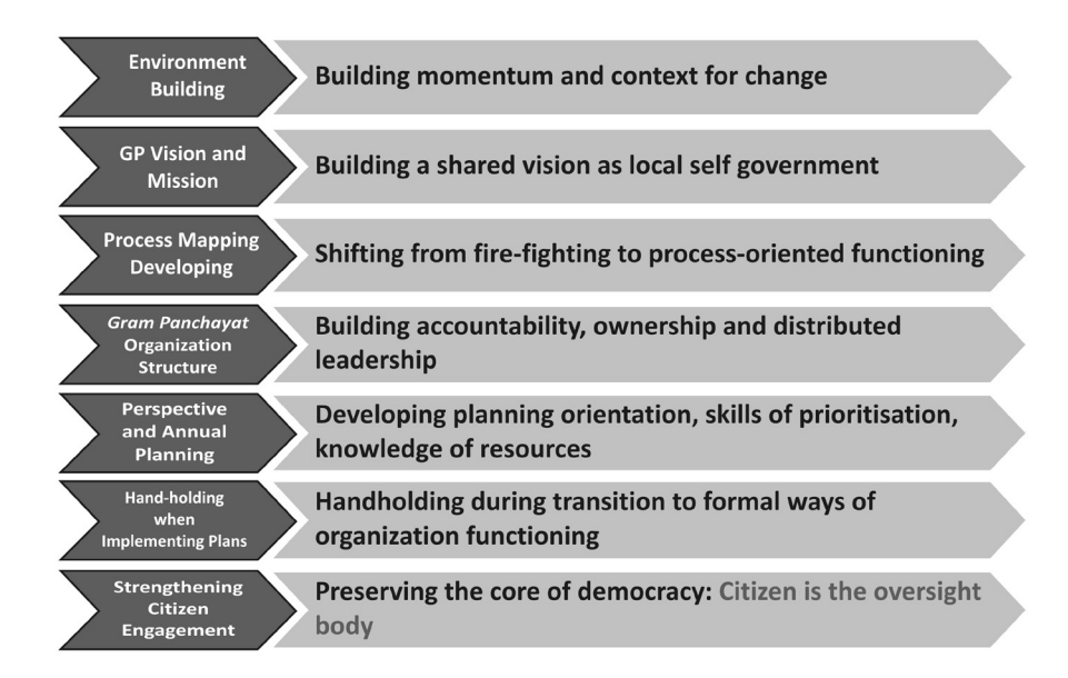
Figure 1: Gram Panchayat Organization Development: Steps

to think of the work areas it wants to prioritize; of how it will achieve its dreams and who are the stakeholders it will focus on. All these steps encourage the gram panchayat to realize its potential as a local self-government body.